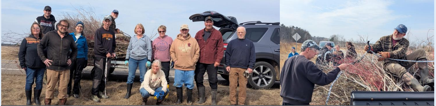
A crew of lake homeowners cutting down and hauling willow.

PCLIA is partnering with Crow Wing Soil & Water in a shoreline restoration project. Last fall an email was sent to all PCLIA members. The purpose was to get 20 properties to participate in the program. We successfully identified 19 properties interested in this project that is being funded by a grant.