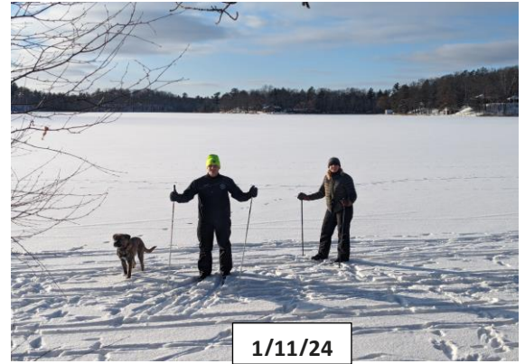
Winter was here for a very short shot.