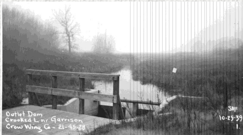
Crooked Lake Dam 1937

The dam controlling the water flow from Crooked Lake to Maple Lake was originally constructed in 1933. Very little information exists about how that dam was constructed. In 1937, as part of the Works Progress Administration, the dam was rebuilt with a stop log design. Stop log is a term used to describe a log, wood plank, or steel beam made to slide into tracks to block the water flow. Multiple stop logs could be stacked in the tracks to raise the dam to a desired height. The 1937 dam had two, five-foot-long stop log bays side by side. The dam was authorized to have 1.6 feet of stop logs in place. There was a wooden catwalk across and the abutments on both sides were paved with hand-placed fieldstone.