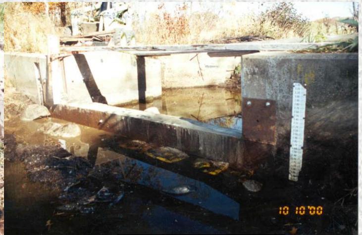
Crooked Lake Dam 2018

The last inspection of the dam was in 2018, but the DNR has been contacted to inspect again.