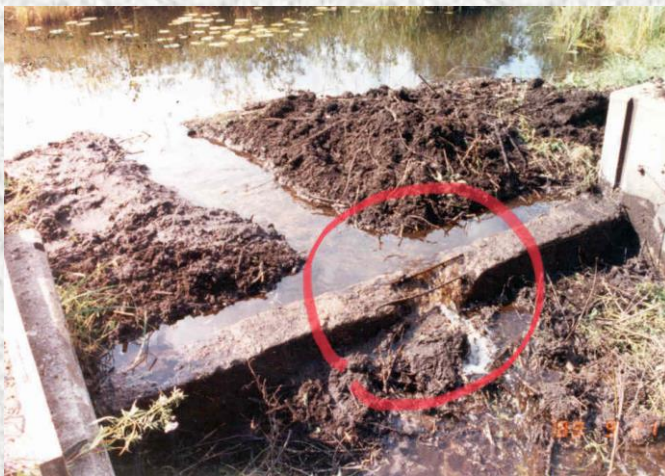
Crooked Lake Dam 2000

The dam was altered in 1948 and again in 1959 by replacing the stop logs with a concrete fixed enclosure. In 2000 a 10- to 12-inch-deep void was found and later repaired using steel plating.