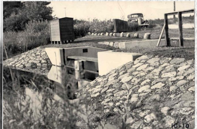
Crooked Lake Dam 1959

The dam was altered in 1948 and again in 1959 by replacing the stop logs with a concrete fixed enclosure. In 2000 a 10- to 12-inch-deep void was found and later repaired using steel plating.