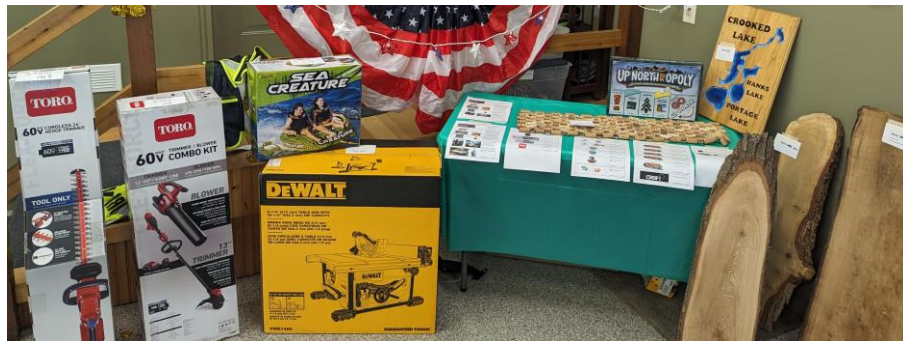
Just a "snapshot" of the many items that will be available for you to bid on!

Donations: Local establishments have already made the donations below. We're working to add to this before the auction. Please support and thank the vendors who support PCLIA!