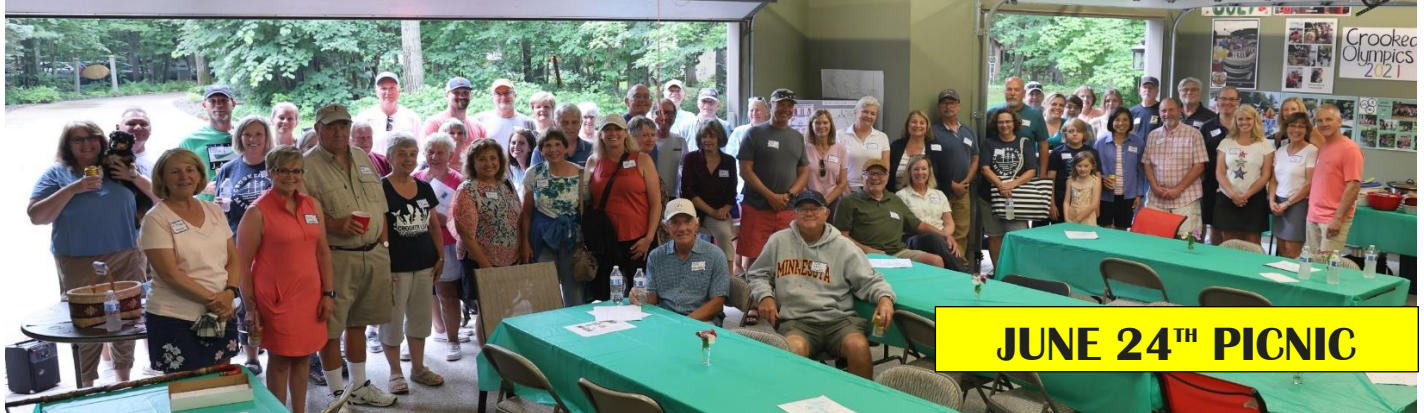
JUNE 24 TH PICNIC