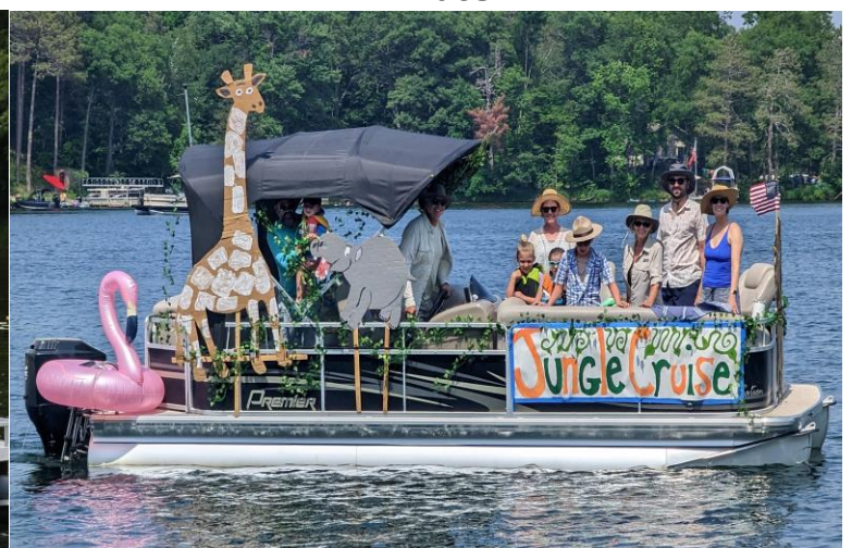
A Tie for 3 rd Place